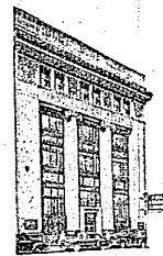
Downtown Headquarters Griswold at Lafayette

Want a home? More home comforts? Your own business? College for the youngsters? Whatever your aim, you'll realize it more surely, thru savings. To make saving easier, First Federal provides a useful thrift bank with each new account. Savings earn 2% current rate; insured to $10,000.