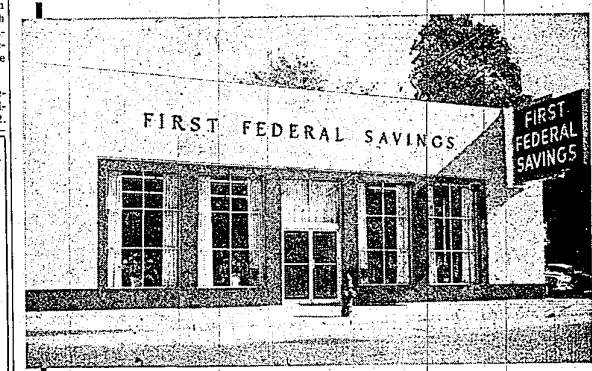
Redford Branch—Grand River at McNichols

OUR REPUTATION RIDES WITH EVERY USED CAR AND TRUCK WE SELL