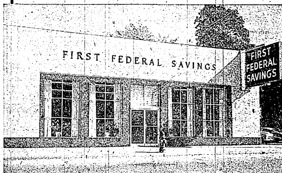
Redford Branch—Grand River at McNichols

A Subscription To The Enterprise Will Bring You 52 News-Packed Copies A Year