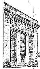
Downtown Headquarters Griswold at Lafayette

First, mail a check or money order for any amount to First Federal (with your name and address) to open your account. Then, with the help of postage-paid mail-saving envelopes furnished you, you can add to savings or withdrawal, whenever you wish, entirely by mail. Savings insured to $10,000; 2% current rate.