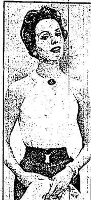
Halter top for shorts or skirts in white or black plique. This Dorothy Korby design is ideal for beach or summertime evening.

Another failing is that of "wearing out" and house-dresses or just plain old clothes at the beach. This is fooling yourself, just like eating that last piece of pie "to keep from wasting it."