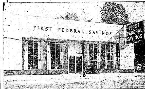
Redford Branch—Grand River at McNichols

There's NOTHING like money in a SAVINGS ACCOUNT