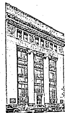
Downtown Headquarters Griswold at Lafayette

Its V8 puts new ROAD MASTERY at your hand