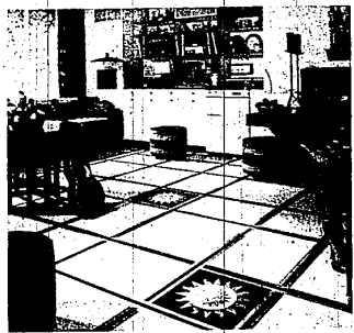
THE 2.5 MILLION home expansions reported for 1972 included room additions and conversions of basements and attics into living quarters like this attractive family room.