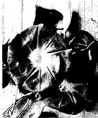
HEAVENLY BLUE morning glories have the clearest blue of the flower kingdom. For a quick-growing vine for color or summer privacy, the morning glory fills the bill to perfection.

Tight space - and tight budgets - are the major reasons for room additions, says a recent nationwide remodeling survey. According to the study, hundreds of thousands of families outgrow their homes each year. Often, the high cost of new homes precludes their moving to larger quarters. The survey shows that in 1973, more than half of all homeowners facing this dilemma will solve it by expanding their present homes. The trend to "make room rather than move" is evident in the more than 2.5 million home expansion projects reported for 1972. These included: 927,200 room additions, 732,000 finished basements, 146,400 attic expansions, and 731,992 bathroom additions. In most cases, the expansions accommodated families of seven or more, and occurred in homes valued at less than $16,000 and from one to 10 years old. The comprehensive survey, which drew a record 75.5 percent response from 1,500 representative households across the country, shows that a majority of home expansions are "entirely" or "partly" do-it-yourself projects. They involve a wide variety of building products, including: wall paneling, carpeting, tile and resilient flooring, ceiling tile, lighting and plumbing fixtures, air conditioning and heating units.