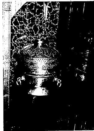
ONE OF THE first things to greet your eyes as you enter the Cordoba is this huge brass pot. Imported from India, it's a rice cooker.

The Cordoba's hours will be 11 a.m. to 11 p.m., Monday-Thursday; 11 a.m. to 12 p.m., Saturday; and 3 to 10 p.m., Sunday.