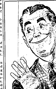
Remember — The Nearest Thing to New Clothes