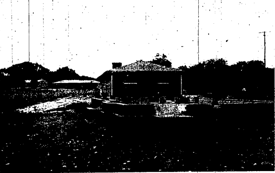
New homes continue to be built in Glen Orchard Subdivision, just north of Ten Mile Road between Orchard Lake and Farmington Roads, as throughout the rest of the township. To assure controlled development and unity in operation, the Glen Orchard Civic Association