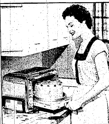
Keep cool when performing those hot-weather cooking chores. An infrared roaster broiler takes care of nearly all cooking functions while adding a minimum quantity of heat to the atmosphere.