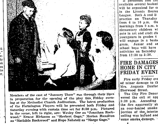
Members of the cast of "January Thaw" ran through their lines in preparation for the opening of the play this Friday evening at the Methodist Church Auditorium.