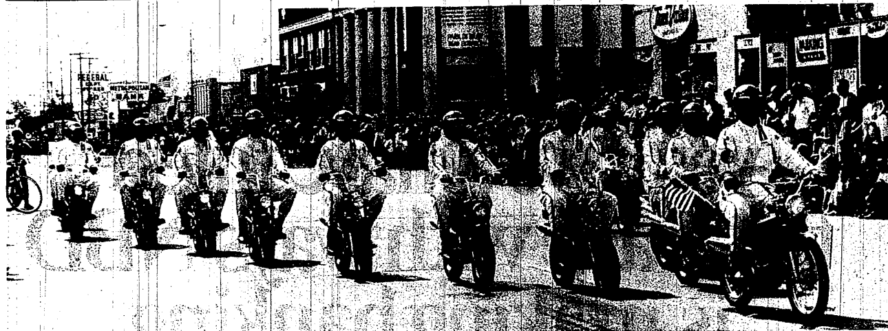
FARMINGTON ELKS won "Best Motorized Paraders" category, a trophy they have been awarded year after year.