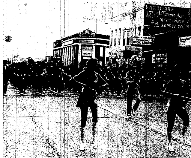
NORTH FARMINGTON took top honors for best high school band in the parade.