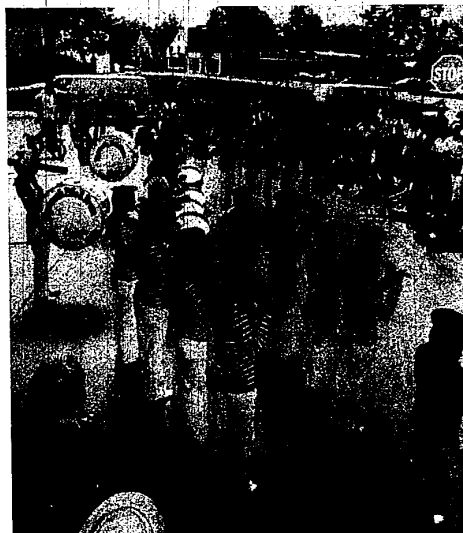
AFTER PERFORMING in Indiana on Saturday and Sunday, the Fife and Drum Corps was back in Plymouth for a concert in Kellogg Park Monday. Today (June 2) the group is playing at Detroit's Fort Wayne museum.