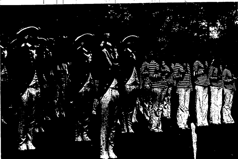
PLYMOUTH'S FIFE and Drum Corps appeared with the historic Old Guard of the 3rd Army from Washington, D.C., at Memorial Day concerts. The Plymouth group is on the

Tippecanoe and Plymouth are among the very few groups outside New England States offering this type of entertainment.