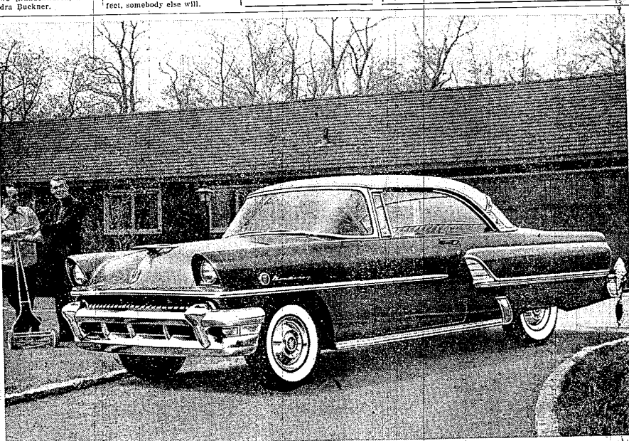
ONE LOOK and you know it's a Mercury. Exclusive Mercury styling is shared by no other car. The smart Monterey Coupe shown above is one of 11 Mercury models in 3 series.