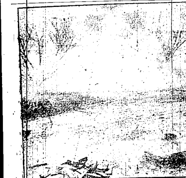
SMOKE SCREENS SOUTH'S ORCHARD DISASTER —Smoke from lumber, sawdust and rubber smudges shrouding peach orchard at Shelby County Penal Farm, Memphis, Tenn., caused millions of dollars in damage to strawberries, watermelons, and other crops. Smoke from lumber, sawdust and rubber smudges shrouding peach orchard at Shelby County Penal Farm, Memphis, Tenn., caused millions of dollars in damage to strawberries, watermelons, and other crops.

LOTS - SOUTH LYON 14 and 1/2 Acres or More RANV TERMS M. F. SCHERL GE. 4-2253 31-3p TEN ROOM farm colonial on 3 acres. Farm. 0564-32. 32-1p TWO LOTS , Middlebelt - 9 Mile section, 3250 each. Call MA. 4-2964. Walled Lake. 32-1p WALLED LAKE - by owner, modern 1 1/2 story, 6 rooms, attached garage, automatic steam heat, conveniently located. MA. 4-2193. 32-2p FOUR ROOM house on 110' x 330' lot, low down payment. GE. 4-2193. 32-1p MOORE HOUSE for the money, 2324 Haynes, 1/2 mile south of Ten Mile, six rooms and utility, newly decorated, refinished hardwood floors, the bath, ample closets, large double cupboards in the kitchen, 8-car garage, sidewalk to acre lot, shrubs and fruit trees, screens and screens, $9,500, $2,000 down. Showed by appointment. Phone Farm. 2062-W. 32-1p BY OWNER - 2 bedroom house, full basement, automatic gas heat, one bath, $9,500. Phone Farm. 2171-R. 32-1p