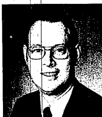
President, Board of Education

Now you can rent the famous multi-purpose, Heavy-Duty REYNOLDS Fully Automatic Water Conditioners that really remove iron and hardness. You can rent the size and model of your choice... the rates on the most popular models range between $6.50 and $9.50 per month. Rent as long as you wish or purchase later... rental fees apply toward the purchase. Investigate the finest products in water conditioning. No obligation. THE QUALITY WATER PEOPLE REYNOLDS WATER CONDITIONING CO. Michigan's oldest water conditioning company toll-free 1-800-552-7717 Serving this area since 1931