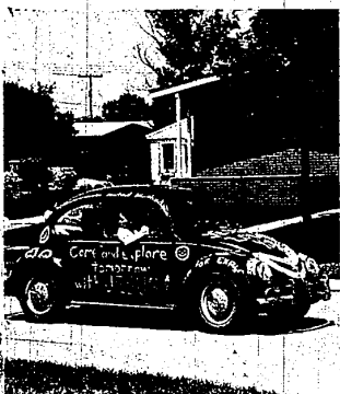
CARS DECORATED with Bible school themes will parade in the neighborhood of Clarenceville United Methodist Church Saturday, June 16.