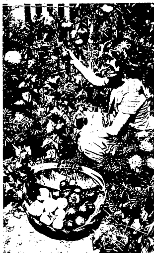
TOMATOES ARE the most popular home-grown vegetable. Tender loving care during their development pays off with a more bountiful yield.

If you are of the millions of Americans who will plant vegetables this year to help reduce the food bill, you should know that the weeks ahead can be crucial in assuring a bountiful harvest.