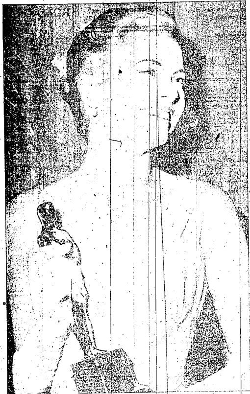
Main Line to Monte Carlo...