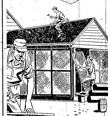
Whether It Is Screening in a New Porch or Putting New Screen on Old Frames

GRASS SEED CITY PARK LAWN SEED — Regular 59c lb. VAUGHANS ... 85c lb. Perennial RYE ... 30c lb.