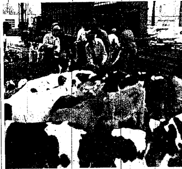
THESE LITTLE DOGIES were put through a second, round-up last Friday morning, within bawling distance of busy Grand River Avenue, when the cattle truck in which they were being overturned at the intersection of Rockwell Avenue. Volunteer citizens, State Police and cattlemen assisted in the roundup. Several calves were killed in the accident, while some others took off for greener pastures in neighborhood yards. However, the majority were corralled after considerable reluctance and herded into trucks for the continued trip to market.

Classified Ads 6A, 5A, 6A Correspondence 2A, 5A, 6A Pg. 35, 39, 49, 57, 7B Pg. 29 Pg. 28 Pg. 27 Pg. 26 Pg. 2A