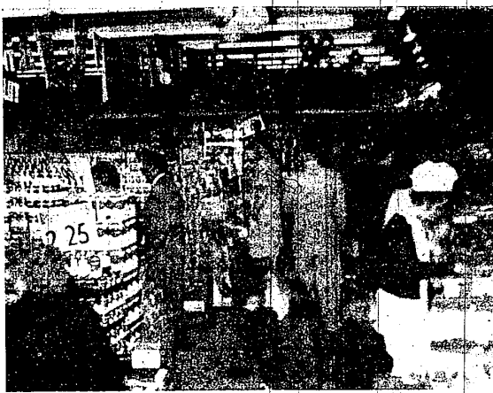
A RECORD CROWD of between 3,500 and 4,000 persons turned out last week end for the four-day grand opening celebration of the new Brown's Super Market on Northwestern Highway at Orchard Lake Road. Shown above is a portion of the over 1,000 shoppers who flocked to the store on the opening day of the celebration, Thursday, to take advantage of the many bargains offered at the new ultra-modern store. Containing over 8,000 square feet of floor space, the new market is equipped and stocked to provide complete food shopping service. The Lawrence Browns, proprietors of the store, are old timers in the grocery business in that area. They previously operated a store on the west side of Orchard Lake Road at Northwestern Highway for 24 years prior to opening their new establishment.

Mr. and Mrs. Bernard Lorengor and their family spent last week end at Houghton Lake with scrub brushers and pools, readying their summer home for this year's vacation. Ron Hagelstein, son of Mr. and Mrs. Floyd Hagelstein of Crystal Court, has been inducted into the Armed Forces and will leave for training within a few days.