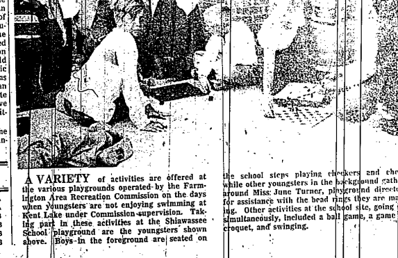
A VARIETY of activities are offered at the various playgrounds operated by the Farmington Area Recreation Commission on the days when youngsters are not enjoying swimming at Lake under Commission supervision. Taking part in these activities at the Shawwassee School playground are the youngsters shown above. Boys in the foreground are seated on

Classified Ads Pgs. 4A, 5A Correspondence 2A, 3A, 7A Editorials Pgs. 1B, 3B, 4B, 5B, 6B Editorial Pgs. 1B, 3B, 4B, 5B, 6B Looking Back Pgs. 2B Michigan Mirror Pgs. 2B