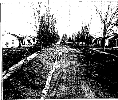
PAVING of Violet Street and a part of Lilac Street in Floral Park Subdivision got underway late last week. As fast as dirt and gravel can be removed from the present roadways, another section of concrete is being laid in the race to complete the entire project before hard freezing weather sets in. This picture was snapped Saturday as workmen prepared another section of road for concrete.

Speculative plans, it was indicated, call for the use of one lane of the present Northwestern Highway in Southfield Township and that portion to the northwest as far as Orchard Lake as a local road. Two more lanes would then be added on either one side or the other of the present divided Northwestern to provide the same limited access setup.