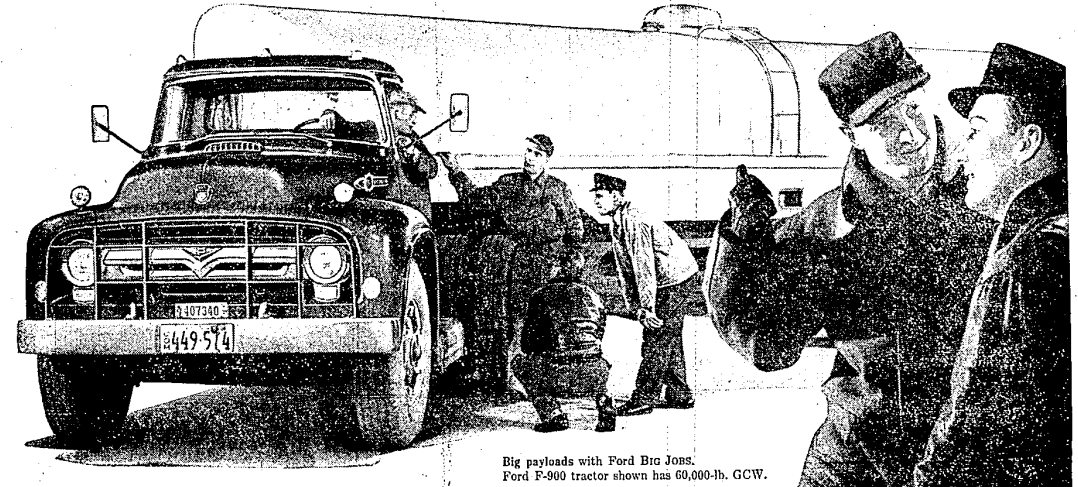
Big payloads with Ford Big Jobs. Ford F-900 tractor shown has 60,000-lb. GCW.