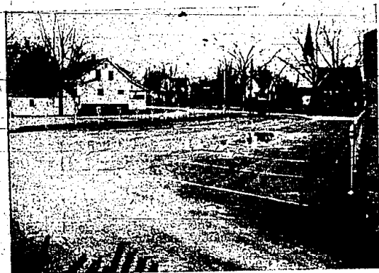
The City, in an effort to improve the parking situation in the business district, has invested funds for developing parking facilities. It has provided a parking lot on the south of Grand River between Liberty Street and Farmington Road. It was designed to accommodate both the short term and the all-day parking. The money received from this lot is returned to a fund set up for future off-street parking facilities. It is a plan which will enable the City to provide more adequate storage of automobiles.