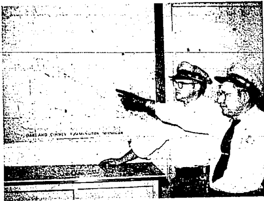
Responsibility for enforcement of the law rests in the hands of our Police Department. Rapid growth of the community has placed a hardship on the eight-man force. The violators are many, the calls are frequent, and our force is small, which adds up to a superhuman task for an undermanned department. The total arrests last year were 136 adult persons and 95 juvenile delinquency cases. The Police were on the road a total of 79,308 miles.