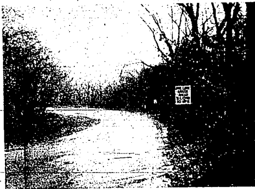
Last year the City repaved McGee Hill or North Farmington Road from Shiawassee to Ten Mile Road. It was one step in the plan to eliminate the hazard created by the sharp curve and sudden decline of the roadway. The planning continues for the elimination of the danger. Even now, there are plans for the widening, relocation and rebuilding being proposed. It is a major project that the City will bear alone. Every effort is being made for finances, right-of-way and engineering data pertaining to the problem.