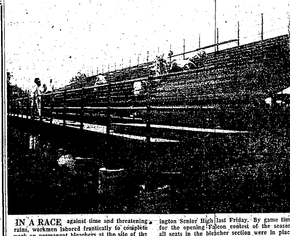
IN A RACE against time and threatening rains, workers labored frantically to complete work on permanent bleachers at the site of the new football field and running track at Farmington Senior High last Friday. By game time for the opening Falcon contest of the season, all seats in the bleacher section were in place and ready for students.

When prosperity comes, do not use all of it. —Confucius