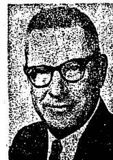
Paid Pol. Ad.