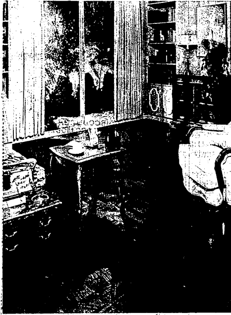
SO REAL-LOOKING is this reproduction of an authentic Louis XIV parquet floor that it might be mistaken for wood. It's not. It's Roanoke Parquet sheet vinyl by Armstrong — at about one-tenth the cost of wood.