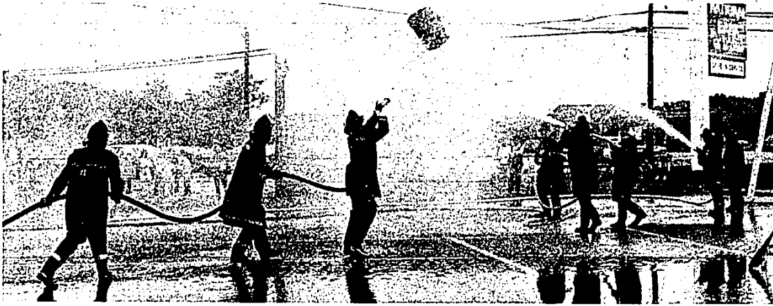
WATER BATTLE--Farmington Hills firemen say kids are welcome at this event.