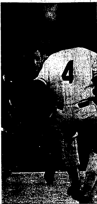
UP AND ALMOST OVER is Fancher's Bob Ganzak (4) in Berry baseball action with Red-