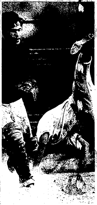
al League with a 15-0 record.