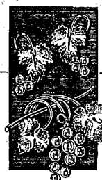
Portrait 197-20, March 1971, p. 10

Kremontz 14 KT. GOLD OVERLAY Grape Motif... beautifully finished in 14kt. yellow gold overlay with graduated cultured pearls. From our new selection of Kremontz Fine Jewelry.