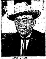
Bob Evans FARMER AND SAUSAGE MAKER