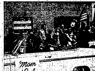
Merchants' Flag Service