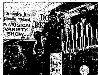
Annual Musical Variety Show