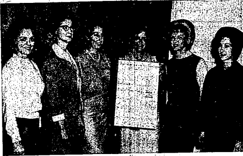
THE FARMINGTON TOWN CLUB will stage its annual Fashion Show Card Party.