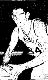
GREGG DOROW Outstanding Soph.