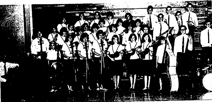
THE FIRST ORCHESTRA FESTIVAL is planned this coming Tuesday evening, June 8, at 8 p.m. in the O. E. Dunckel Junior High School on 12 Mile Road just east of Farmington Road.