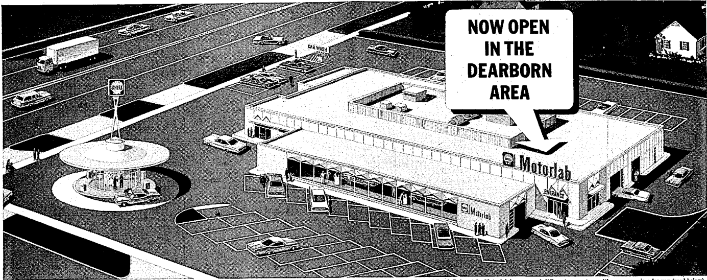
The new Shell Motorlab is now open at the corner of Joy and Beech-Daly roads. Motorlab is a new and different car center—with some surprises for you (read below).