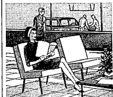
You can relax, read—even shop—in the new Shell Motorlab's air-conditioned Customer's Lounge.

passes along the five test stations of Motorlab's "Diagnostic Lane."