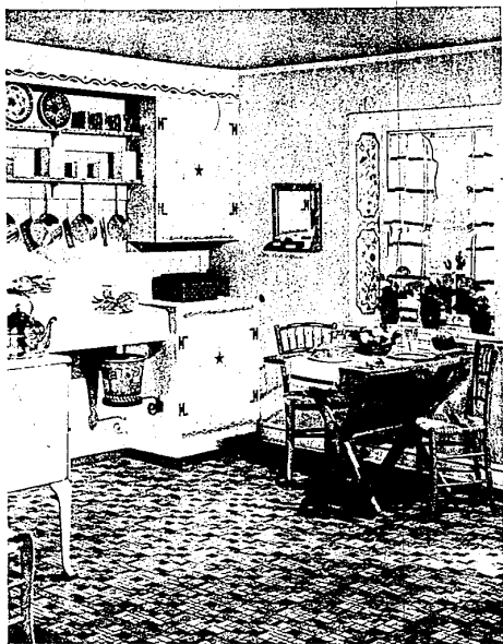
THE 1932 ADVERTISEMENTS carrying this picture read "Help yourself to a happier kitchen. In this charming, peasant style kitchen the time-mellowed tile design is Armstrong's .... linoleum No. 5352."