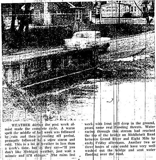
WEATHER during the past week almost made the complete cycle. A warm spell the middle of last week was followed by rain and then a cooling off period, promptly followed by a snow storm and cold. This is a lot of weather in less than a week's time, but as they say—"If you don't like Michigan weather, just wait a minute and it'll change." The rains last week, with frost still deep in the ground, posed some real flooding threats. Water racing through this stream had reached the top of the bridge on Middlebelt Road between Grand River and Eighth Mile by early Friday afternoon. Another two or three hours of rain could have very well washed out the bridge and sent water flooding over the road.