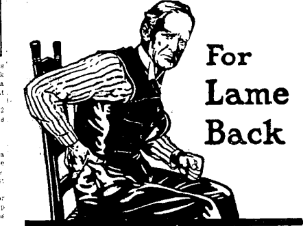
For Lame Back

An aching back is instantly relieved by an application of Sloan's Liniment.