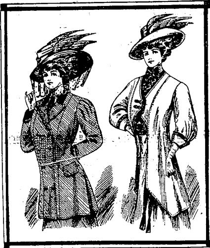
These designs are suitable for making up in cloth that may be worn with any skirt. For instance, the first would look well in brown cloth. It is especially good for winter wear, as being double-breasted. It is warm; the collar is faced with velvet, so are the turned-up cuffs. Hat of brown stretched satin, trimmed with satin and wings.

Materials required for the jacket: Two and a half yards 52 inches wide, five yards lining silk, half yard velvet.