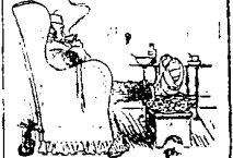
Mr. Gouty—Thank heaven, I'm not a centipede.