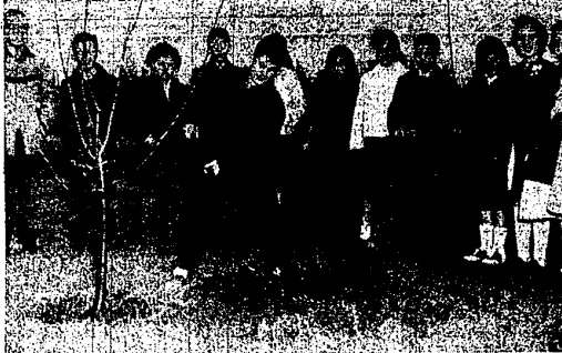
STUDENTS form a semi-circle around a newly planted tree at Middlebelt school as a fellow pupil replaces dug-up earth. This was the climax of the Arbor Day program presented at the school last Thursday.