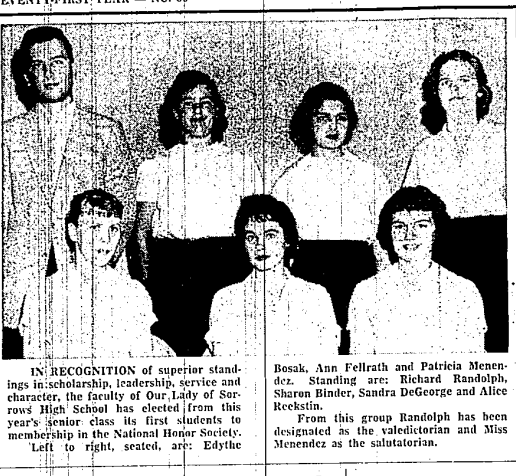
IN RECOGNITION of superior standing scholarship, leadership, service and character, the faculty of Our Lady of Sorrows High School has elected from this year's senior class its first students to membership in the National Honor Society.