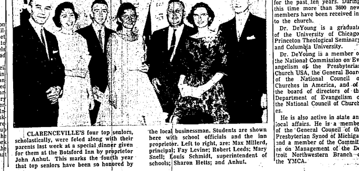
CLARENCEVILLE'S four top seniors, who were elected along with the Clarenceville High School Board...