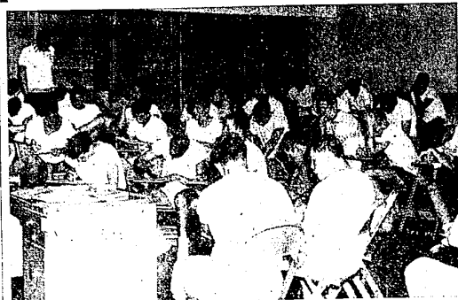
BRAWN HELPS but brains are needed too in this modern-day brand of football. Taking a break from rough blocking and tackling drills, running through plays and controlled scrimmages, members of the Farmington Falcon football team moved