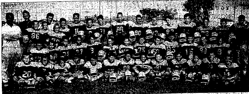
CHALKING UP a gridiron championship for Farmington again this year were members of the Our Lady of Sorrows Catholic Youth Organization grade school team. The team went undefeated this season and were scored on only twice.