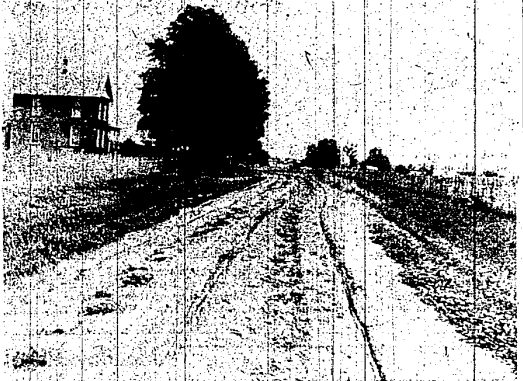
BACK ABOUT 50 years ago roads were nothing much more than dirt paths. Most, except a few major roads, were put in by the private farm landowner. They had to farm and no further. Look closely at the roadway and you should be able to see some wagon-wheel tracks and horses' hoof marks. Note also that snow-fences are up on either side of the roadway.