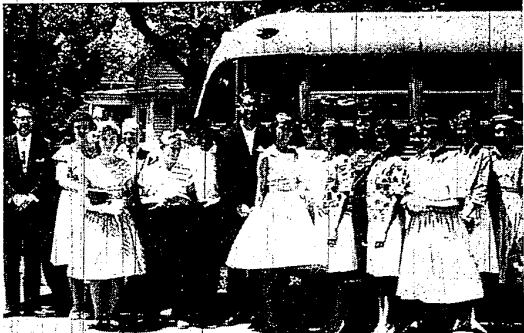
A GROUP of young teenagers, members of the Salem Church Senior Sunday School Class, and young teenage friends from other church groups are shown here just before boarding a bus for Detroit to learn more about the differences of the various religions. They visited Catholic, Jewish and Protestant churches on the trip.