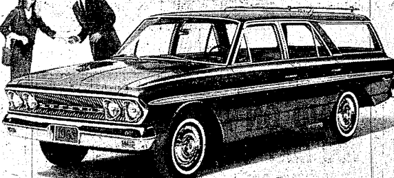
1963 Rambler Classic Six 770 Gross Country Station Wagon.