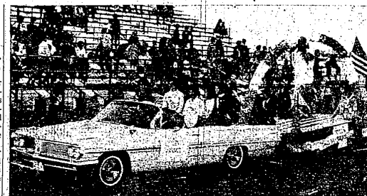
A COLORFUL PARADE of floats marked the halftime festivities at Farmington Senior High School last Friday when the Falcons played host to Pontiac Northern. The float above was made by the FHS