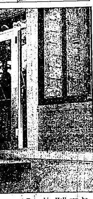
TOWNSHIP SUPERVISOR Curt Hall inspected the late stages of construction on the new Farmington Township office building last week.

More cases of vandalism were reported to Farmington Township Police this past week with a delinquent school being held over the weekend.