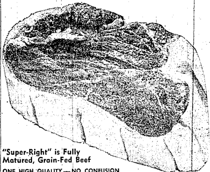
"Super-Right" is Fully Matured, Grain-Fed Beef ONE HIGH QUALITY—NO CONFUSION ONE PRICE AS ADVERTISED

Have Your Prescriptions Filled at Bradley Rexall Drug 23366 Farmington Rd. GR. 4-3123 25 Yrs. in Farmington